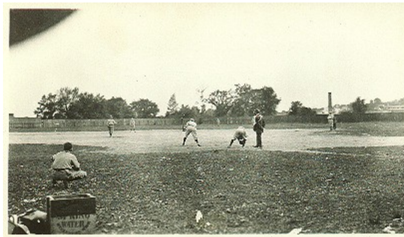
Baseball game at Crocker Field, ca. 1910